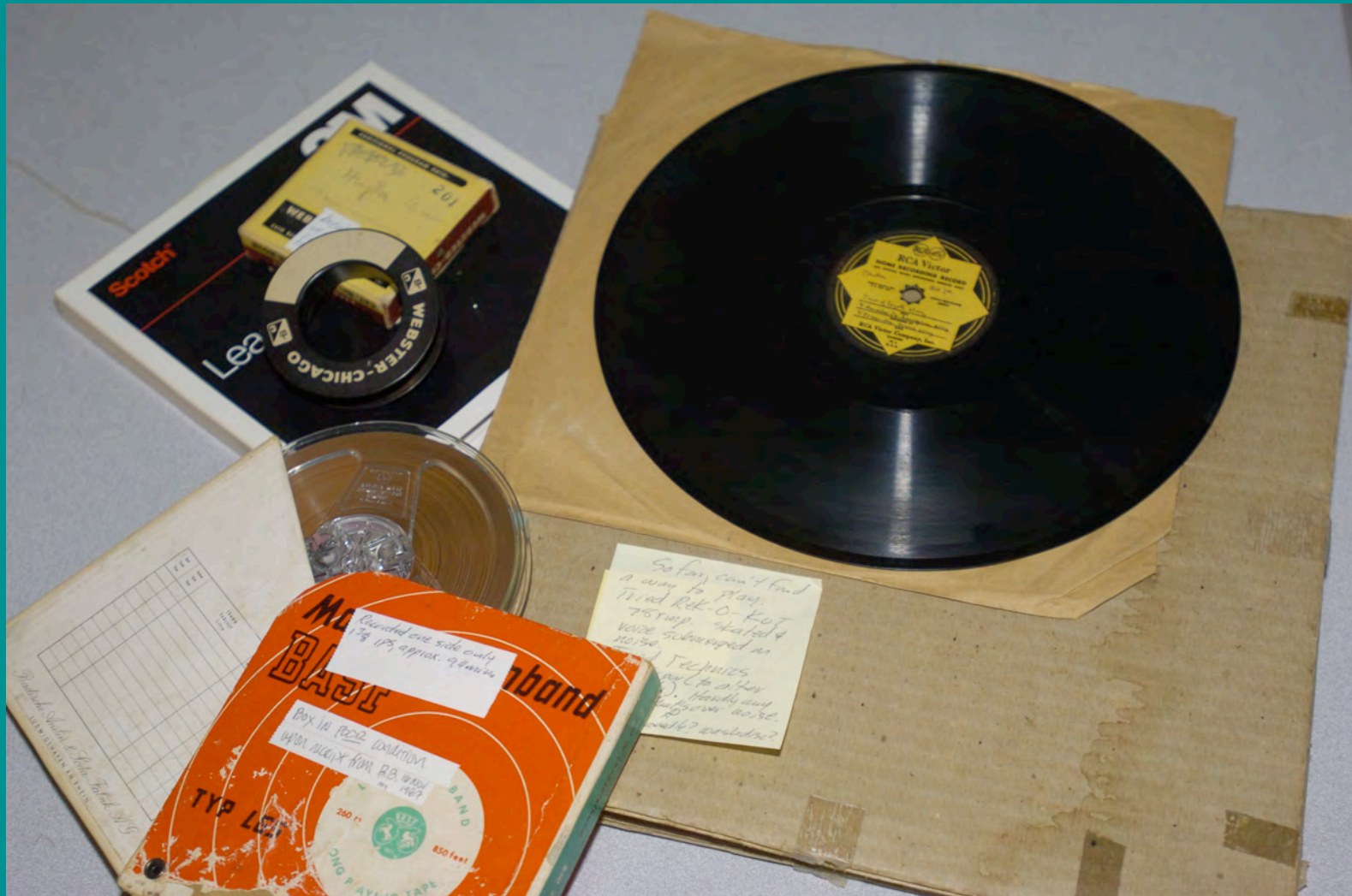
Examples of the various media on which original materials are deposited (various reel-to-reel formats, magnetic wire, phonographs)