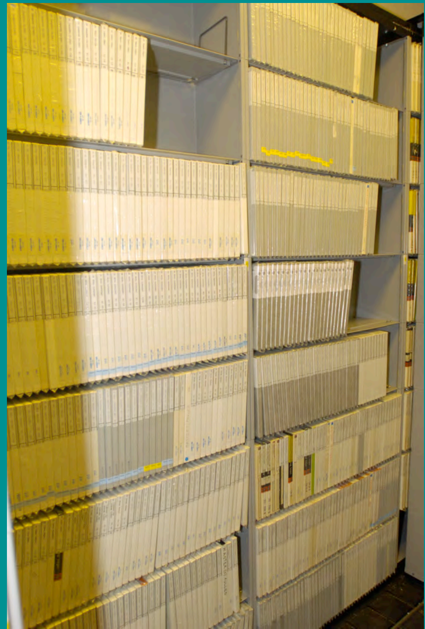
Storage of the original materials (left) and the mastered reel-to-reel tapes (right)